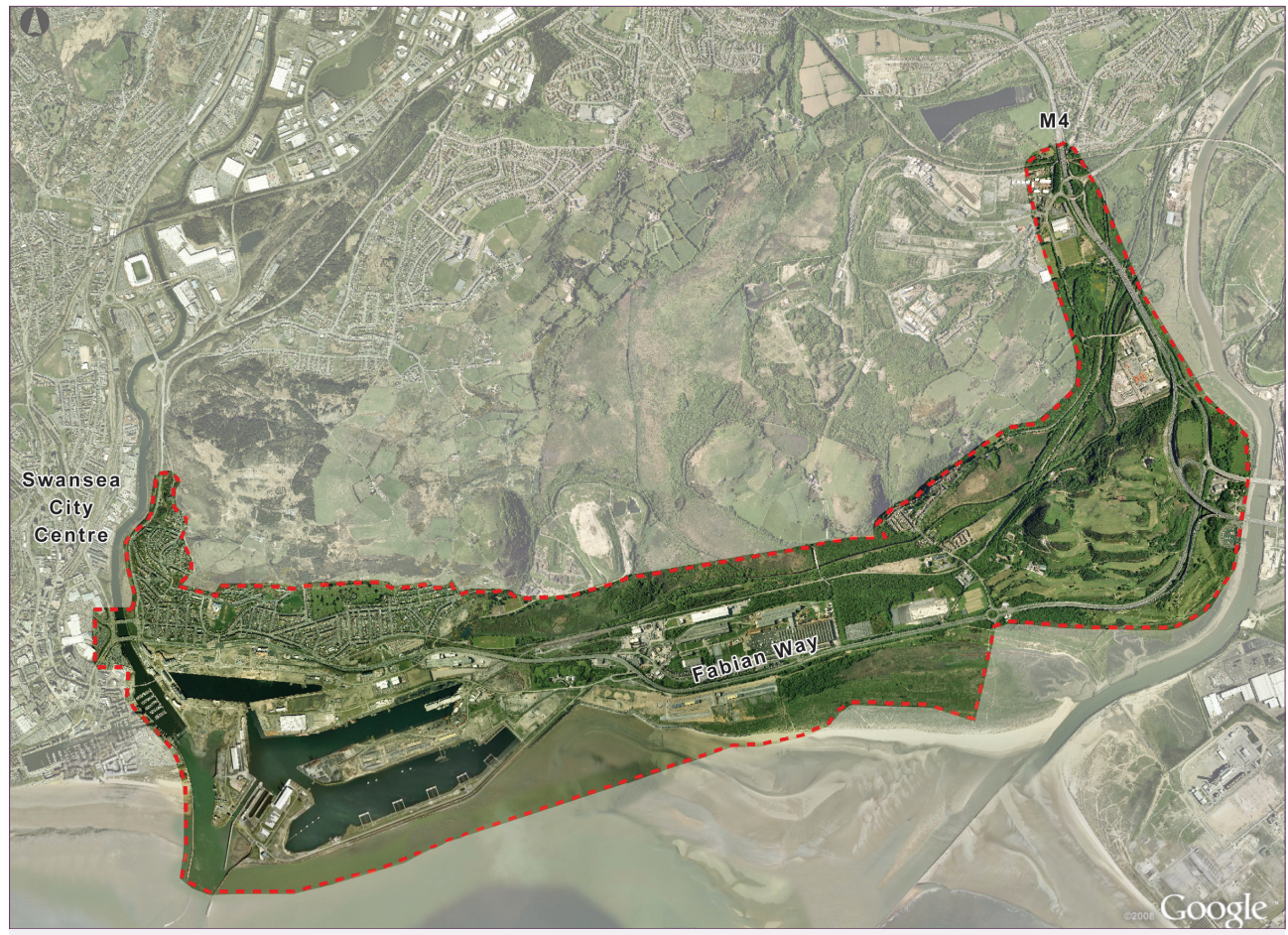
Aerial view of study area