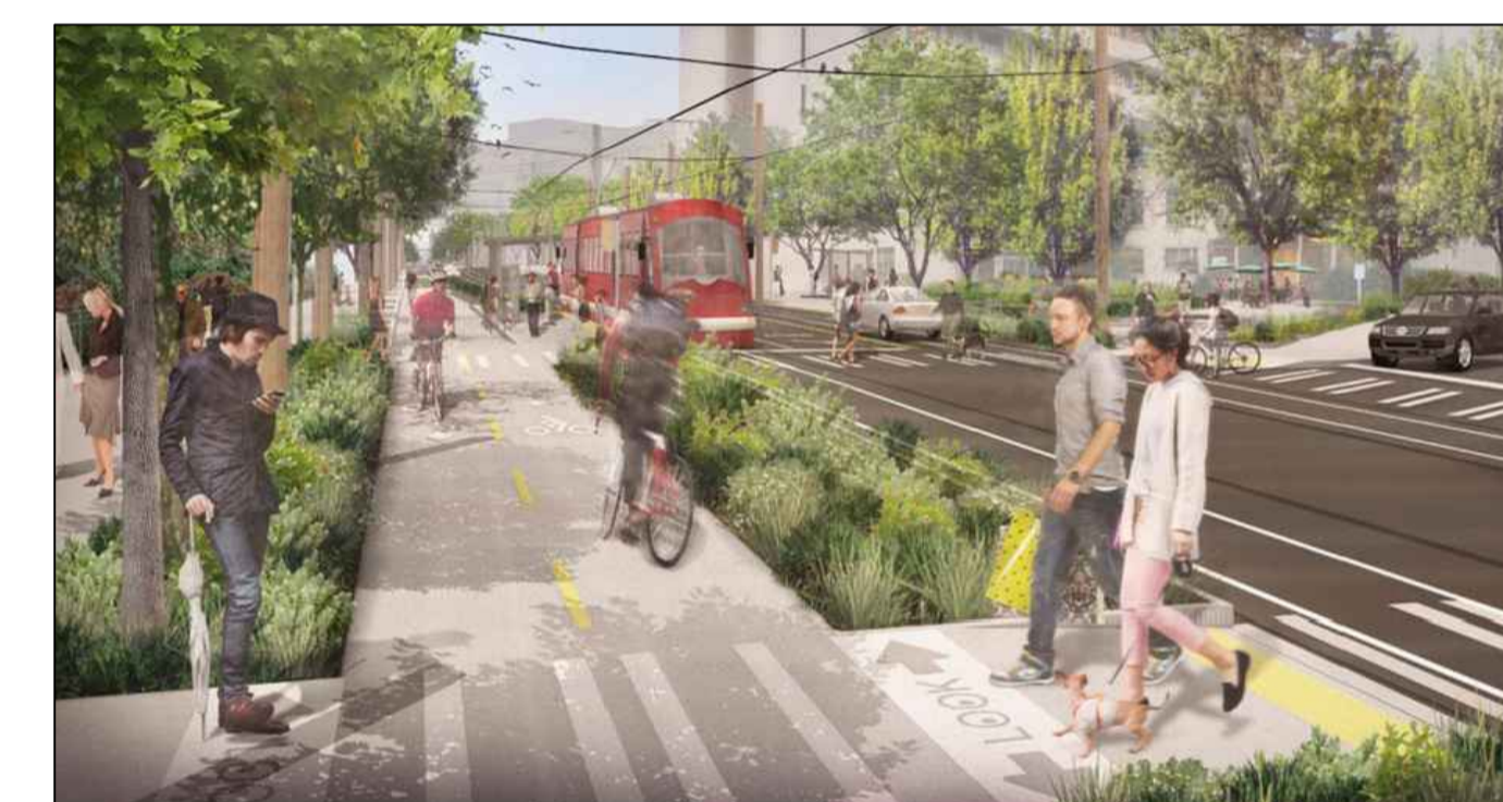
GRANITE EDGED PLANTING AREAS TO THE FOOTWAY EDGE WILL CREATE GREEN LUNGS ALONG THE STREET EDGE, DIFFUSE POLLUTION & PROVIDE ATTRACTIVE BACKDROPS FOR SEATING.