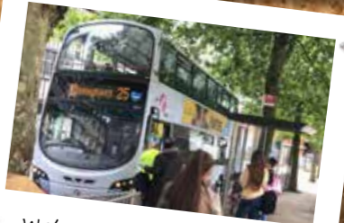
We've put up more than 100 new bus stops in a city-wide modernisation programme