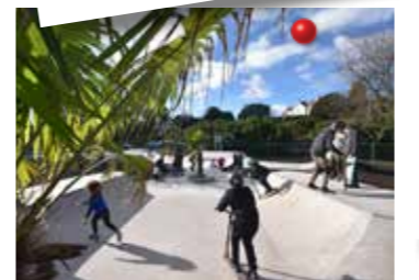
We pledged £1m for a new era of skate parks across our city