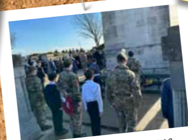
We're now taking care of all of Swansea's war memorials