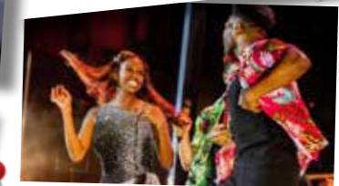
More than 350,000 visitors to Swansea Arena have helped boost our city centre's £164m transformation