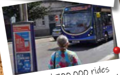
Around 700,000 rides completed so far in Wales' first school holiday free bus ride offer