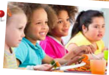
10,000 pupils enjoyed access to free school meals with charges frozen for everyone else