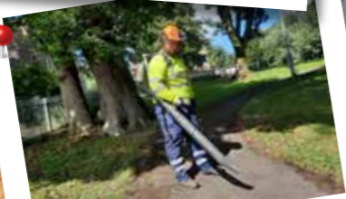
We spent more than £2m tackling litter and fly-tipping