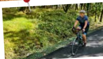
Our 75-mile active travel network has been extended with three new routes for even more walkers and cyclists to enjoy