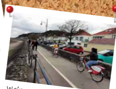
We're creating a new prom and seawall for Mumbles with £17.3m committed so far