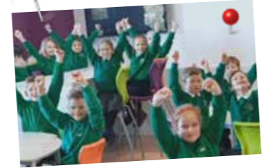
We've invested £128m in new schools and upgrades and a £7m sports barn at Cefn Hengoed