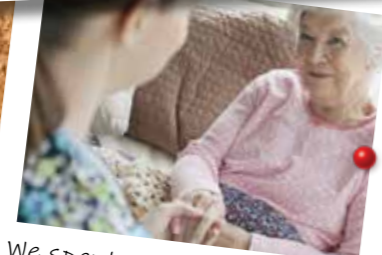
We spent more than £157m looking after older people and vulnerable children