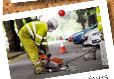
More than 6,400 potholes fixed and road improvements for every community in our £5m highways programme