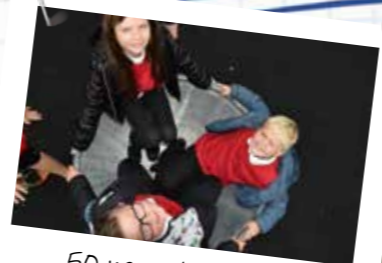
50 new play areas completed with more to come in our £7m upgrade programme