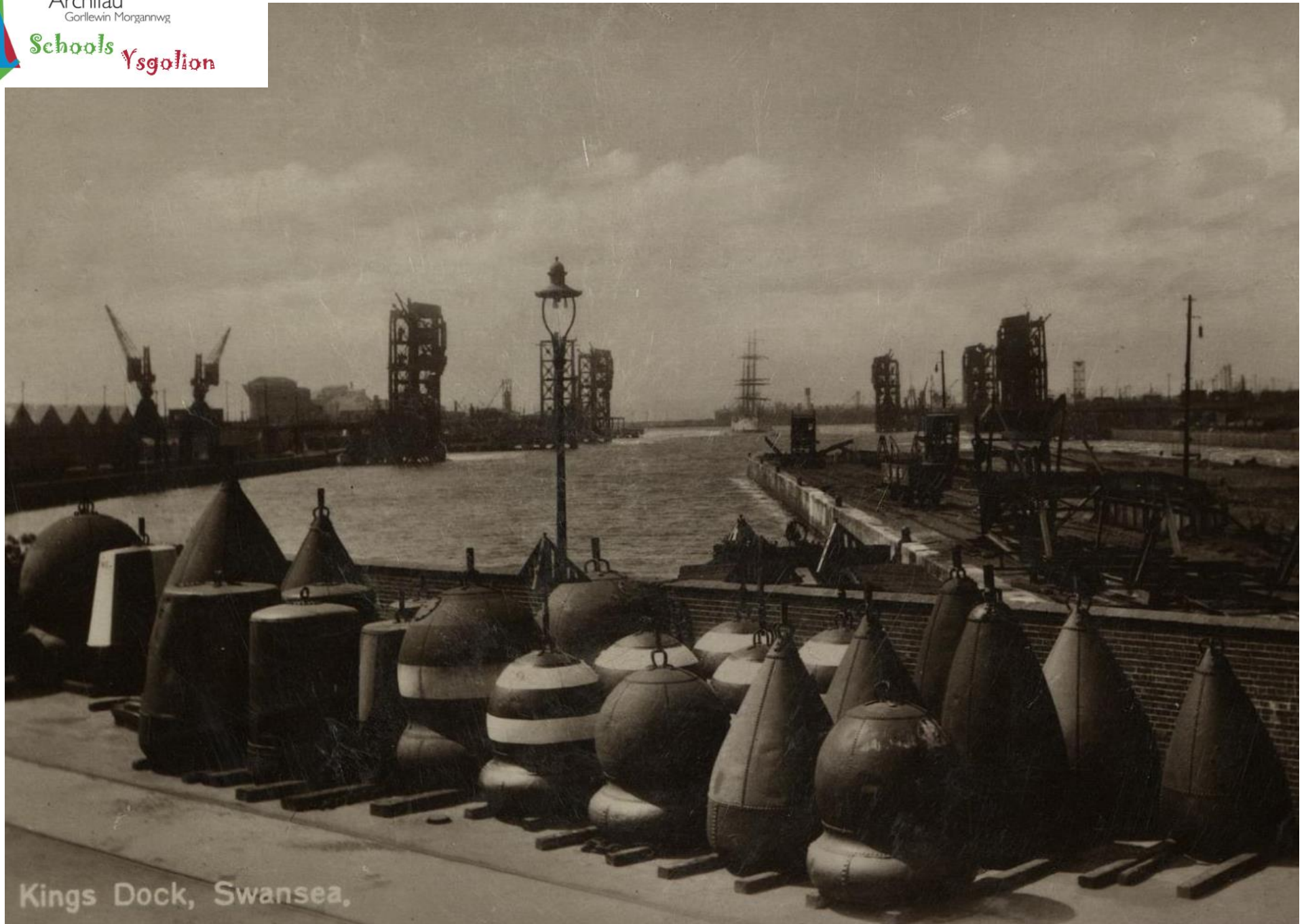
Kings Dock, Swansea.